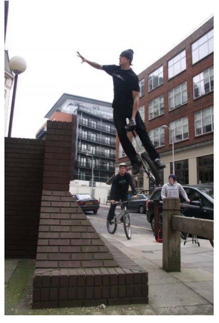
Some great unicycle riders came as well