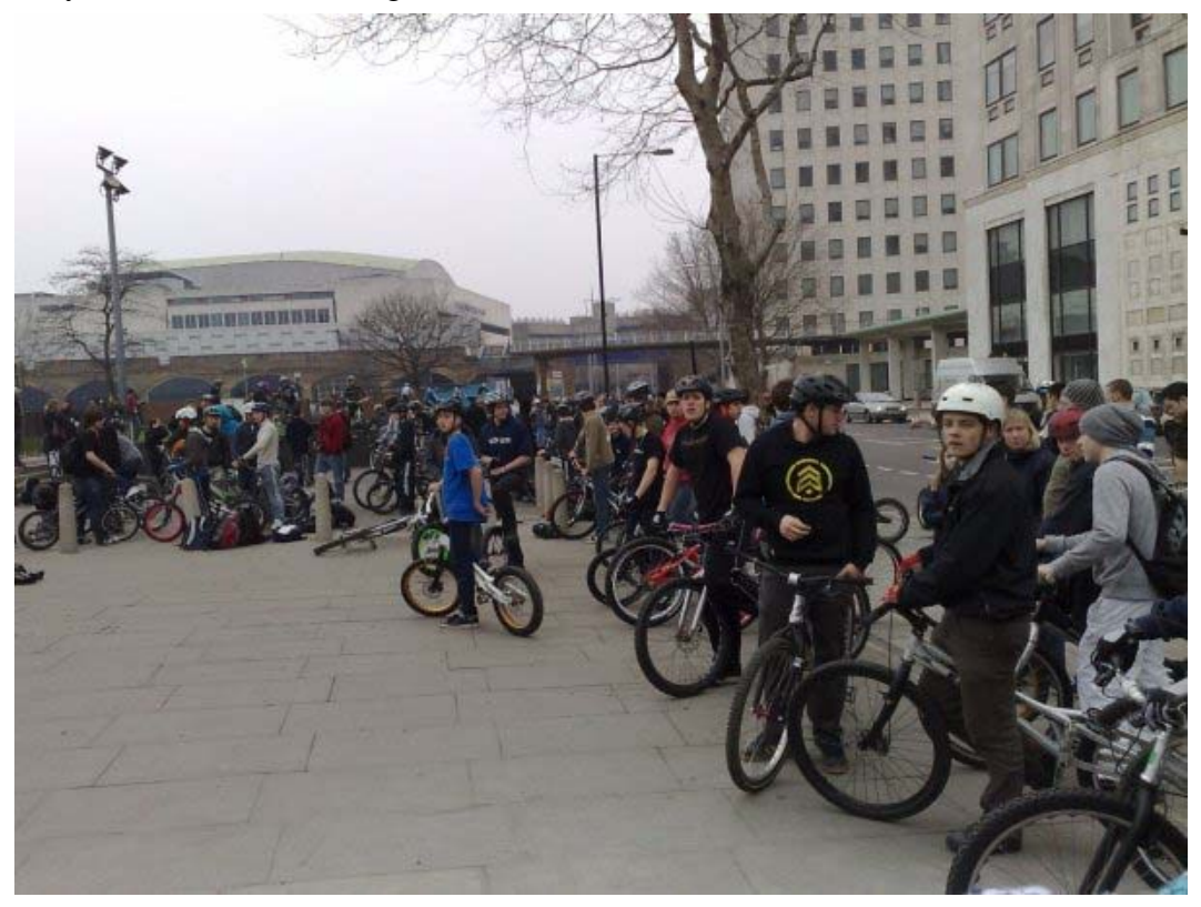
The initial meeting at London Eye