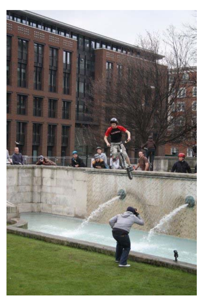
The BIG gap at St Paul's cathedral